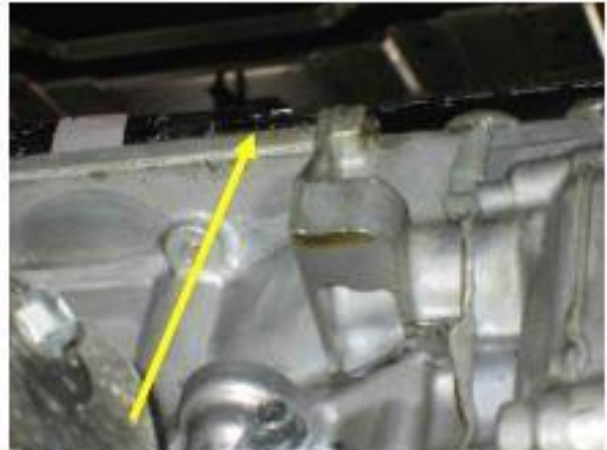
Figure 2. Images of head/valve cover gasket leaks.